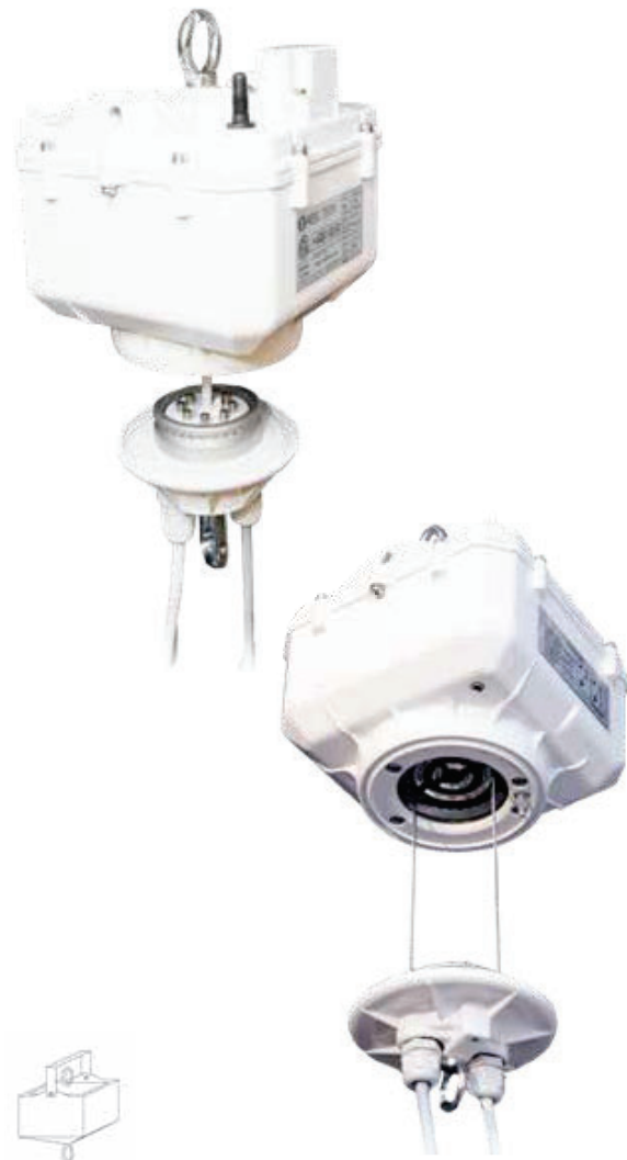
Dimensions: PSI-20 M, PSI-30 M