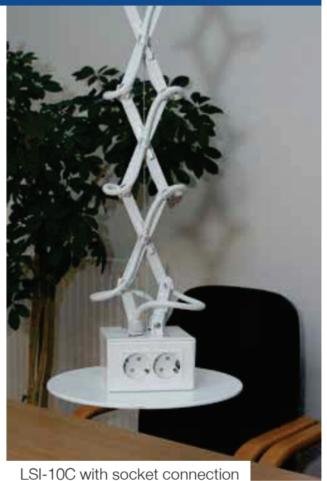
LSI-10C with socket connection