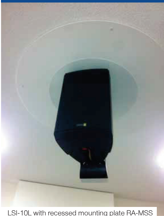
LSI-10L with recessed mounting plate RA-MSS