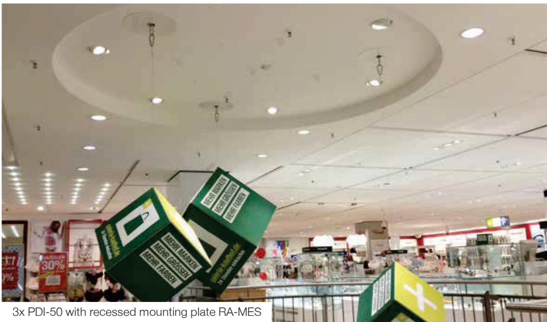
3x PDI-50 with recessed mounting plate RA-MES