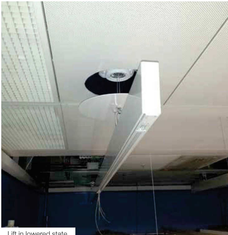
Lift in lowered state